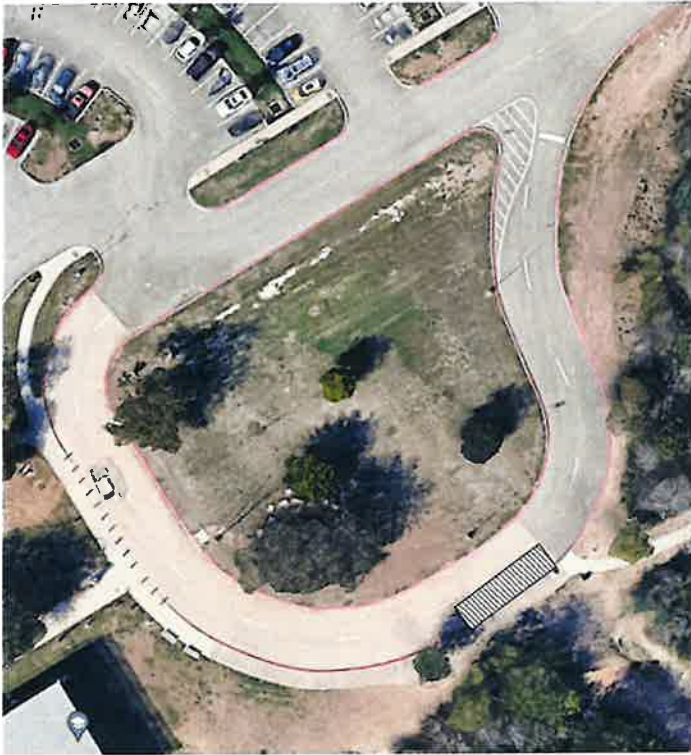
Location 2 (Kruse Circle)