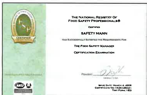
National Registry of Food Safety Professionals

The below examinations are accredited by the American National Standards Institute *(ANSI) using standards set by Conference for Food Protection and developed following the strictest test development procedures. These examinations are accepted in all states and jurisdictions that recognize those standards