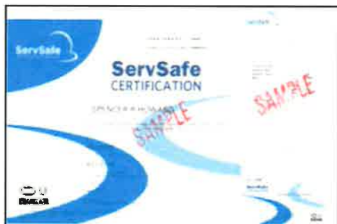
National Restaurant Association Solutions, LLC