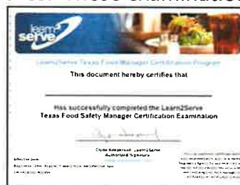
Learn2Serve.com Online Examination 360training.com