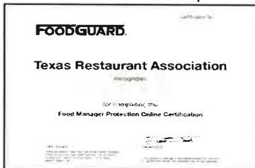
Texas Restaurant Association Online Examination

The below examinations are accredited by the Texas Department of State Health Services using standards set by Conference for Food Protection and developed following the strictest test development procedures. These examinations are accepted in *Texas Only