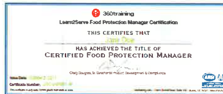
Learn2Serve.com Online Examination 360training.com