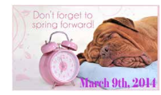
Don't forget to move your clocks ahead one hour on Sunday, March 9, 2014 at 2:00 am.