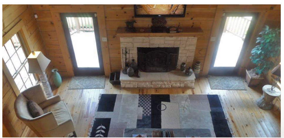
The information herein was obtained from sources deemed reliable; however, DH Realty Partners, Inc. makes no guarantees, warranties, or representations as to the completeness of accuracy thereof. The presentation of this property is submitted subject to errors, omissions, changes of price, prior to sale or lease, or withdrawal without notice. All Floor plans, property lines, areas, and dimensions are approximate and for illustration purposes only. DHRP | DH Realty Partners, Inc. @2023. A Texas Corporation.