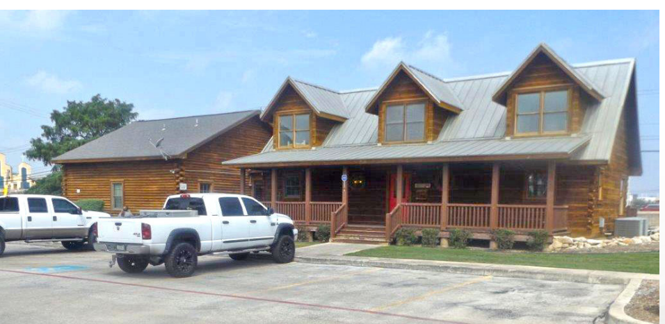
The information herein was obtained from sources deemed reliable; however, DH Realty Partners, Inc. makes no guarantees, warranties, or representations as to the completeness of accuracy thereof. The presentation of this property is submitted subject to errors, omissions, changes of price, prior to sale or lease, or withdrawal without notice. All Floor plans, property lines, areas, and dimensions are approximate and for illustration purposes only. DHRP | DH Realty Partners, Inc. ®2023. A Texas Corporation.