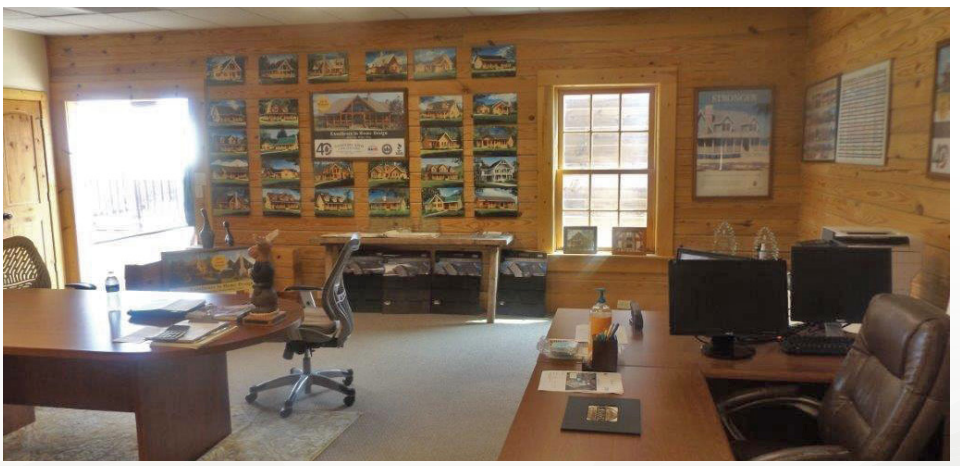
The information herein was obtained from sources deemed reliable; however, DH Realty Partners, Inc. makes no guarantees, warranties, or representations as to the completeness of accuracy thereof. The presentation of this property is submitted subject to errors, omissions, changes of price, prior to sale or lease, or withdrawal without notice. All Floor plans, property lines, areas, and dimensions are approximate and for illustration purposes only. DHRP | DH Realty Partners, Inc. ®2023. A Texas Corporation.