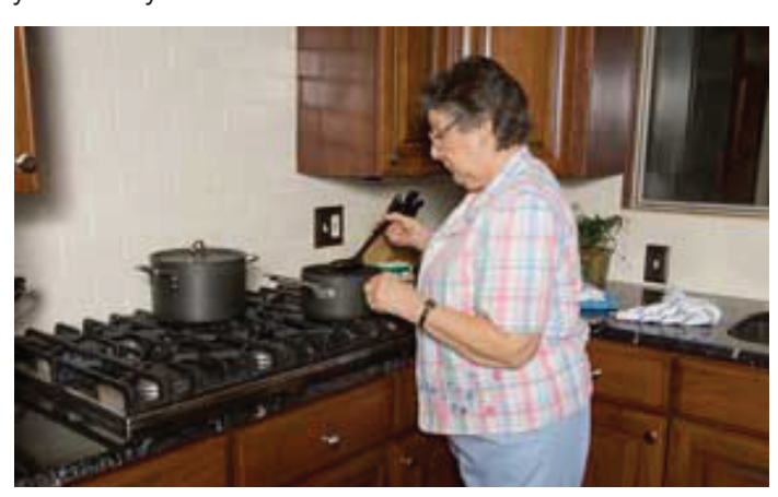
This message is from the US Fire Administration. For more information please visit www.usfa.dhs.gov/

Live Oak Civic Center 8101 Pat Booker Road (210) 653-9494 (210) 653-0158