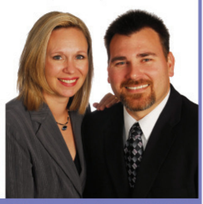
Call to Set your Appointment and Start Feeling Better TODAY