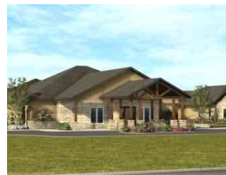
Advanced Rehabilitation & Healthcare of Live Oak Adjacent Rehab Center