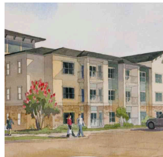
Adjacent Aspire Apartments